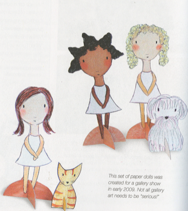
This set of paper dolls was created for a gallery show in early 2009. Not all gallery art needs to be "serious!"

IT'S FUN TO PLAY WITH PAPER DOLLS! (It's even more fun to see grown men play with paper dolls, which happened in our household recently.) Indulge your inner child by creating a personalized set of paper dolls, complete with pets.